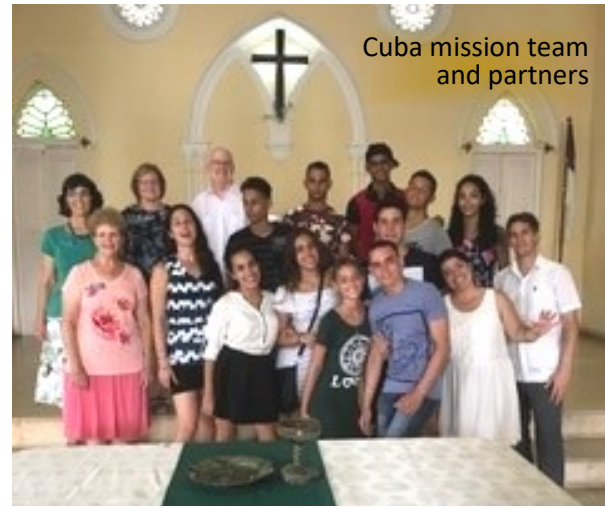
Cuba mission team and partners