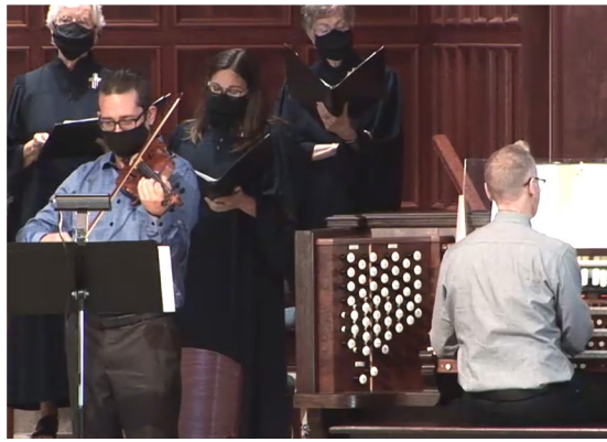
We worship in person and through live-streaming.

You demonstrate care for one another and lives are changed.