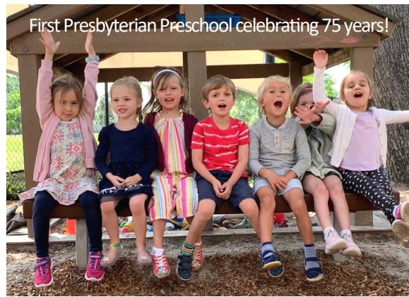
First Presbyterian Preschool celebrating 75 years!