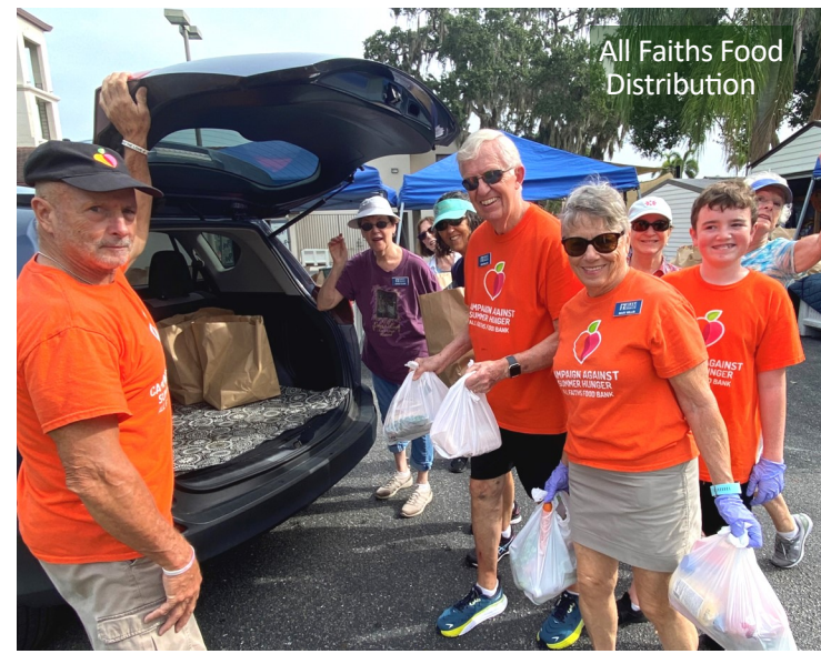
All Faiths Food Distribution

You demonstrate care for one another and lives are changed.