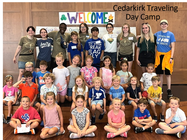
Cedarkirk Traveling Day Camp

This is a place to belong . . . . . . It's where I belong —and YOU belong here, too!