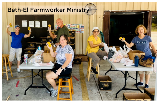
Beth-El Farmworker Ministry

This is a friendly, accepting church family, welcoming the unique gifts of all.