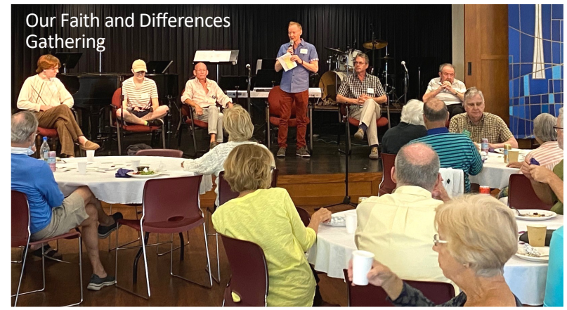
Our Faith and Differences Gathering